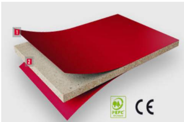
Panel wood Mé laminé

Acoustic partition on the office Damier is composed of a 19mm thick panel of melamine and Absorbruits® panels 20 and 40 mm thicknesses of flexible convoluted foam with exceptional quality absorption noise glued surface 2 sides .