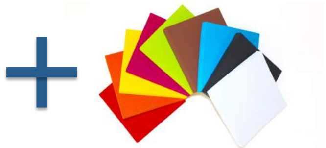
Panel Absorbruit® foam Replaceable if damaged or needs