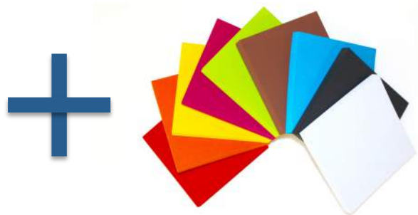
Panel Absorbruit® foam Replaceable if damaged or needs